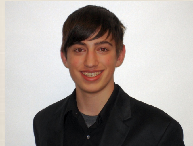
Kleab Silorey Capac B