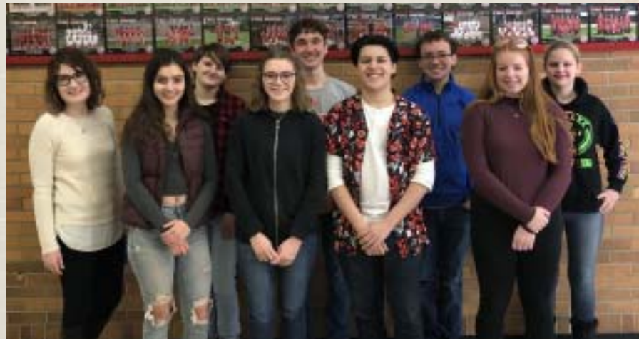
Port Huron High